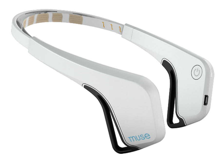
Related link: <a href="https://www.choosemuse.com">https://www.choosemuse.com</a>