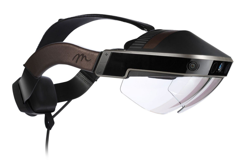
Meta 2 Augmented Reality Eyeglasses

Related link: <a href="https://www.metavision.com">https://www.metavision.com</a>