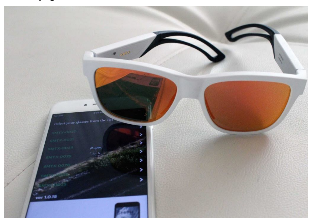
Related link: <a href="https://www.youtube.com/watch?v=5CZtoYbfbHU">https://www.youtube.com/watch?v=5CZtoYbfbHU</a>